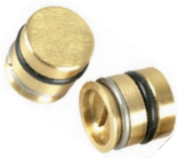
Canal Pressure Plugs Channel Plug Equivalent