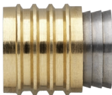
Pressure Plugs Channel Plug Equivalent